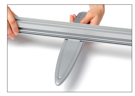
Twist to 90° and stop.