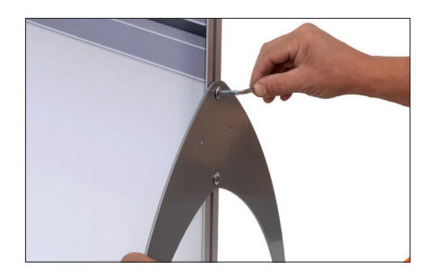
3 Lock the two screws with the included Allen key.