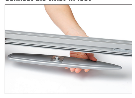
Attach the foot parallel to the profile, at any desired position.