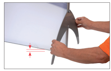
2 Attach the foot to the frame, arrange the frame approx. 10-12 mm / 1/2" from the floor.