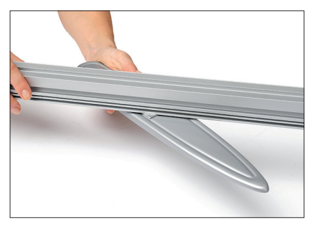
Twist the foot to lock in place. Foot can be twisted in either direction, depending on which end you prefer for the front of your display.