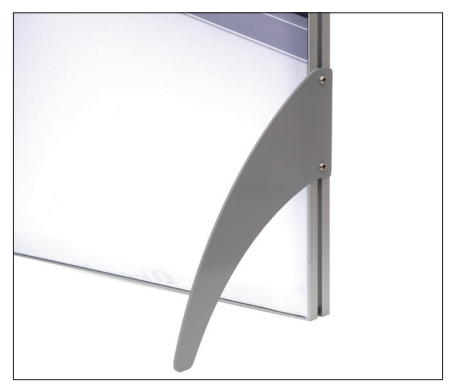
Arched Half Side Foot

For large size Single frames to be placed against a wall IS-9612